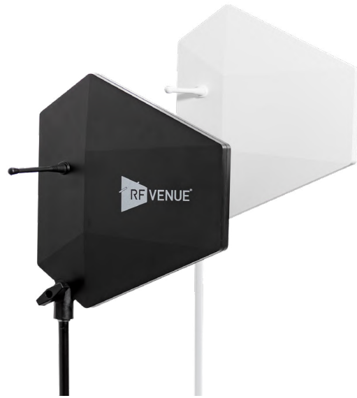
SKUs DFIN-IPX, DFIN-IPXW

The Diversity Fin IPX Antenna is best set up facing edgewise, with the narrow most part of the antenna being aimed toward the wireless microphones. On the left side of the antenna are the labeled LPDA and Dipole antenna outputs; plug both of these BNC outputs into your wireless microphone receiver or Distro to achieve diversity with your wireless microphones. For best results, maintain line of sight between the antenna and the wireless microphones.