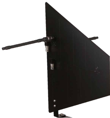
SKU DFINB Includes: Black Diversity Fin Antenna Black wall mount bracket