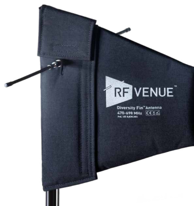
SKU DFIN Includes: Black Diversity Fin Antenna Padded Cover Stand mount bracket