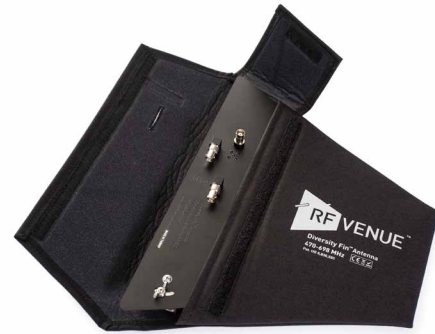
The Diversity Fin has two elements and requires two coax cables (not included).

The Diversity Fin has found widespread adoption across multiple pro audio segments for its performance, convenience, space, and cost benefits.