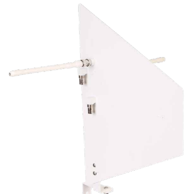
SKU DFINW Includes: White Diversity Fin Antenna White wall mount bracket